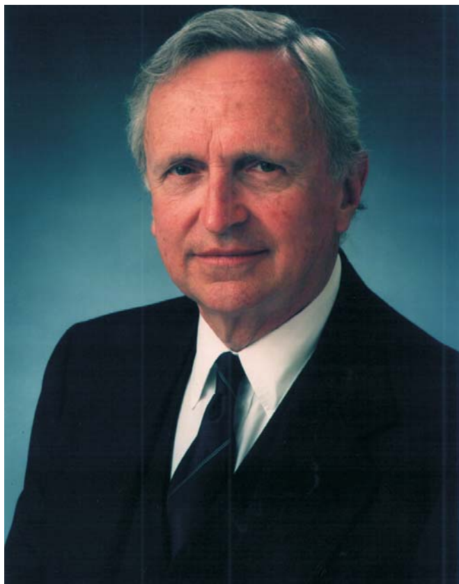
Edgar Fahs Smith Memorial Lecture Dr. Ronald Breslow