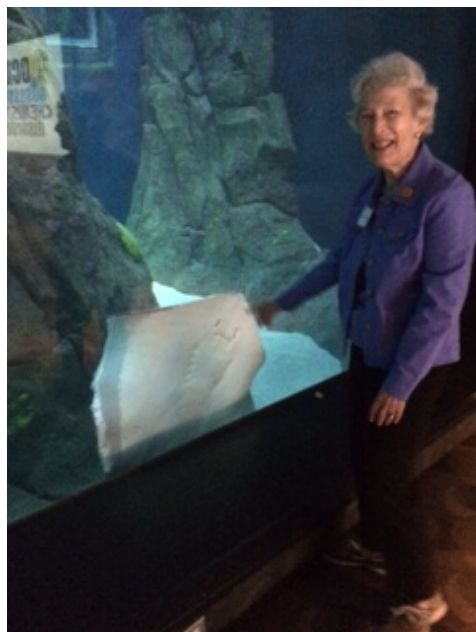
Fun with Fish at Adventure Aquarium in June