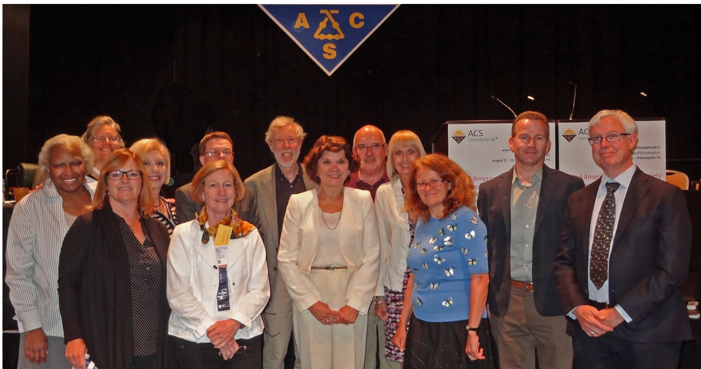
Philadelphia Section Councilors at the National Meeting

[1] https://www.acs.org/content/acs/en/careers/career-services/ethics/the-chemical-professionals-code-of-conduct.html