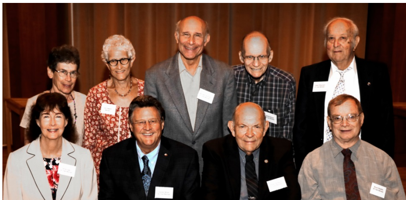
50- and 60-Year Members at the June Luncheon