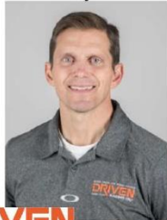
Lake Speed Jr.